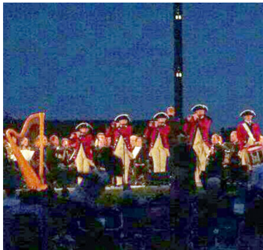
The Old Guard fife, drum, and bugle corps.