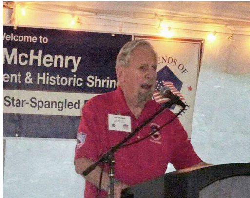
Walden tells the tale