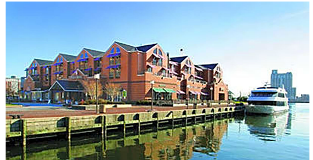
Pier Five Hotel

The Baltimore Council will close out the year with its Annual Meeting and Banquet on Wednesday, 4 December 2019. We are pleased to announce a new venue for this signature event: the Pier Five Hotel at the Inner Harbor. We'll begin