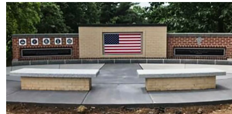
Veterans Memorial at Calvert Hall.

Sea Cadet Corps were invited to take part in the dedication ceremony.