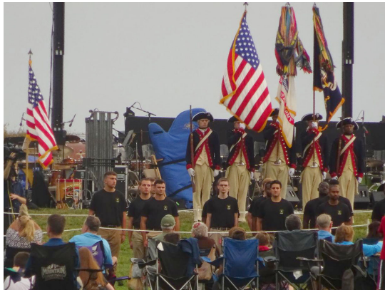
The Old Guard troops the colors