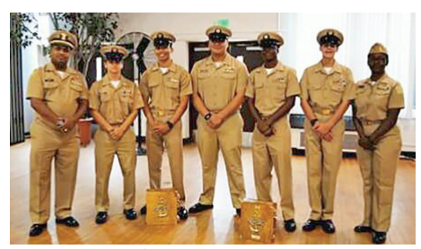
The new Chiefs

With school back in session the Baltimore Council will be busy this spring with the annual award ceremonies that take place each year honoring members of the youth programs we sponsor and otherwise support. Already plans have been made for presentations at two Baltimore are high schools which include JROTC programs as electives. And the Fort McHenry Division / Training Ship Constellation units of the United States Naval and Navy League Sea Cadet Corps continue to flourish.