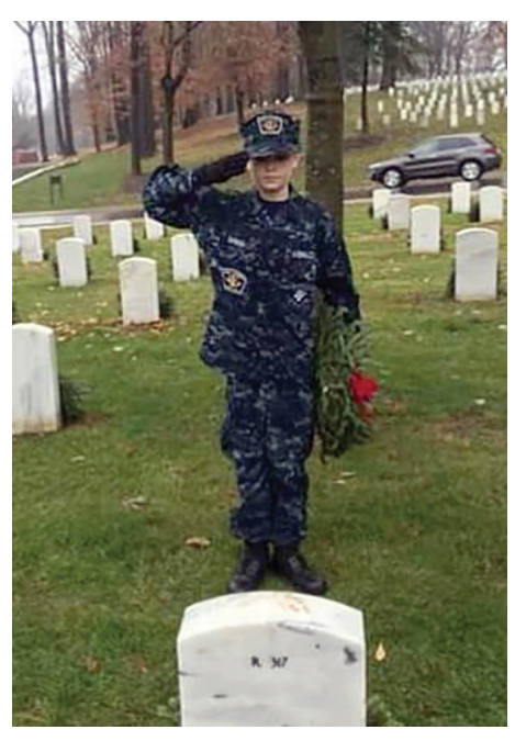
Honoring Fallen Heroes

If you are the parent or grandparent of a young person who could benefit from involvement in such an organization we suggest you contact your local unit of the Sea Cadets. In Baltimore, the units sponsored by this council are headquartered at the Navy Operational Support Center (NOSC) on Whetstone (Locust) Point adjacent to Fort McHenry. \mathbf{\overline{\psi}}