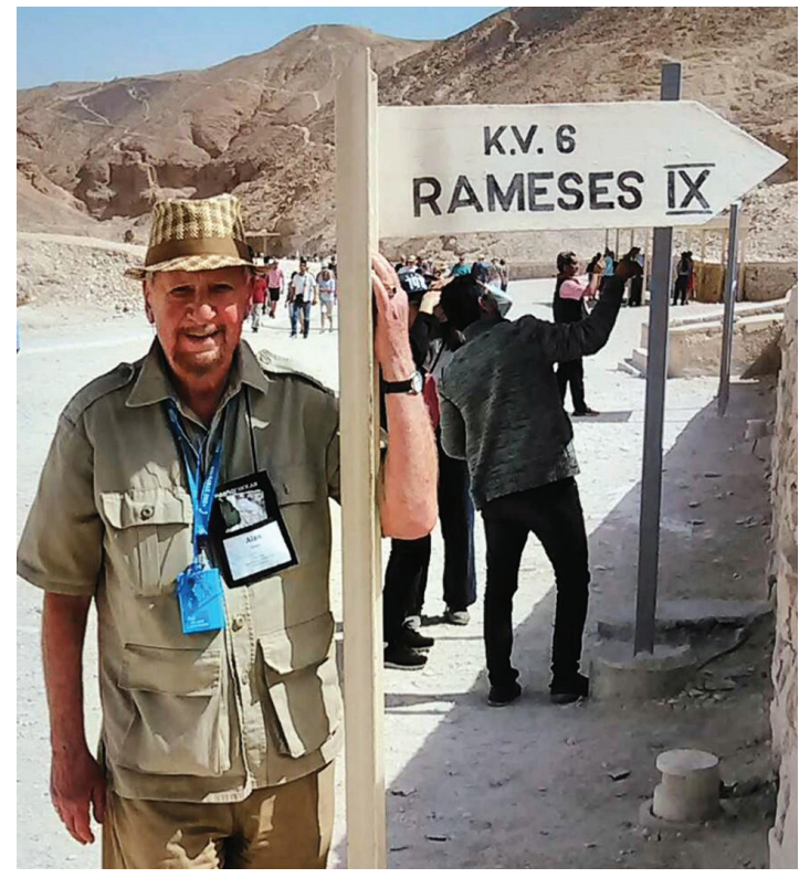
Valley of the Kings

What was distressing was to experience the state of decay into which that once proud empire has fallen since its days of glory. Modern Egypt is not a happy place. Politically it is a military dictatorship and an armed camp. Everywhere we went we were confronted by military and paramilitary forces; roadblocks, patrols, checkpoints. We even had an armed guard in close company and, often, a police escort as we made our way from site to site. Time and again we were told Egypt is still trying to recover what is euphemistically and relentlessly referred to as "The Crisis." Not the Middle East Wars of the 1960s and 70s, but the Arab Spring of 2011 that brought the Muslim Brotherhood to shortlived power. Egypt's population still identifies as around 80+ percent Muslim, 15 percent Coptic Christian, and a mere 5 percent "other" including a nearly microscopic number of Jews where once there were tens of thousands. But Islam is no longer regarded as a major factor in government. The regime of President (General) Abdel Fatah El Sisi is secular in nature. He is regarded as a geopolitical ally of the United States and a bulwark against the Islamic theocracies that constantly threaten to overwhelm the Middle East. But it is a tenuous alliance at the best.