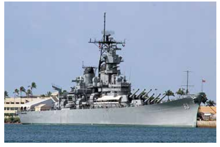
USS Missouri at Pearl Harbor