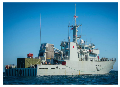
HMCS Glace Bay

neighborhood of Fells Point," he said. "It's nice to be in a port, interacting with the people in Baltimore. Last night, we were at the ballgame. There were lots of people over there, and it was fantastic."