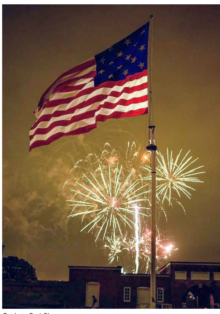
Rockets Red Glare