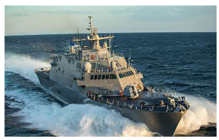
USS Minneapolis-St. Paul