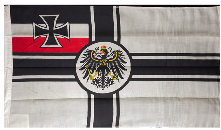
Imperial German Navy battle ensign

director and offered my services as a lecturer on the subject he was, at first, reluctant to add it to the schedule of events. But persistence won him over, And for an hour on one of those gray and windswept days for which the North Sea is noted, the story was told to an audience of true believers; mostly veterans of the Armed Forces and their companions