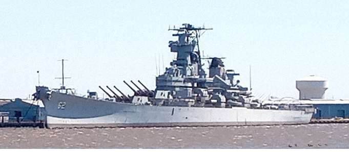
USS New Jersey (BB-62)

Finally, I couldn't resist. How could a Navy Leaguer not have his picture taken at the helm of one of the historic ships nearby. Ah, well. \mathbf{\overline{\Psi}}