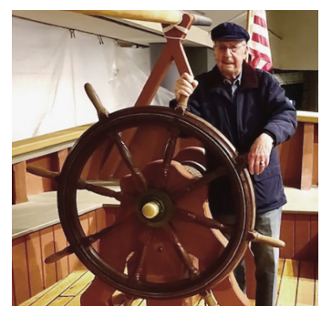
Steady As She Goes

their bucket lists. It also provided a perfect location to see, in all her glory across the river in Camden NJ, "Big J," a.k.a "The Black