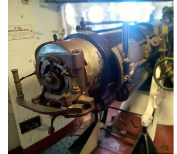
Secondary armament below